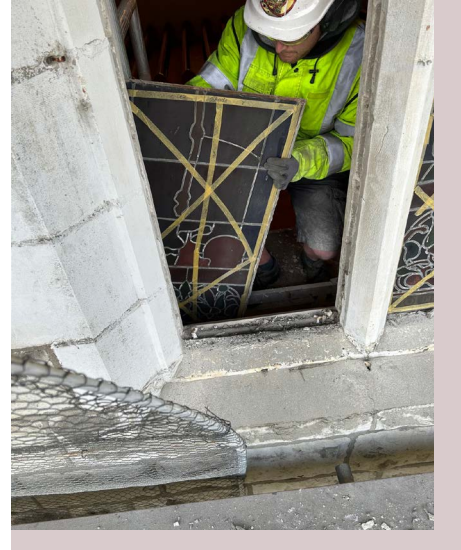
Carefully removing a stained glass window

We are a large parish. In order to build community, we must never underestimate the power of our small groups. For it is the Holy Spirit working within ordinary people, who empowers us to do extraordinary things.