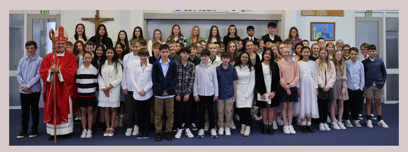
Christchurch North Parish - 64 young people celebrated the Sacrament of Confirmation at Christ the King Church, Burnside, on 18 June, 2023