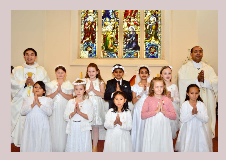
St Patrick's Catholic Parish, Greymouth - 10 children received their first Holy Communion in St Patrick's Church, Greymouth, on 18 June 2023

Heavenly Father, We pray for all who have recently received their First Holy Communion and the Sacrament of Confirmation. May your Holy Spirit help them to grow in faith, hope and love. May they come to know you as the one true God who loves them without limit. May their hearts welcome you gladly; May their ears hear your voice in the scriptures; May their eyes see you in all things; And may they love you and proclaim your glory as they walk in the ways of Jesus Christ, our Lord and Saviour. Amen