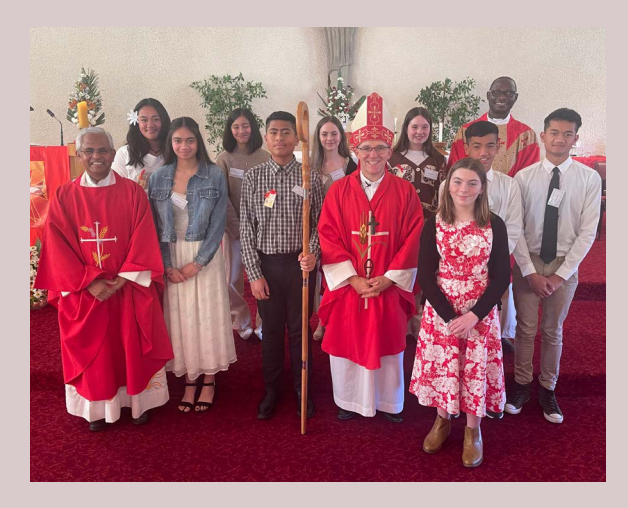
Christchurch East Parish - Confirmation Mass, Pentecost Sunday, 28 May 2023